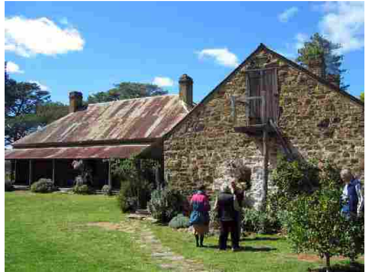
Hillasmount showing the kitchen's stone wall