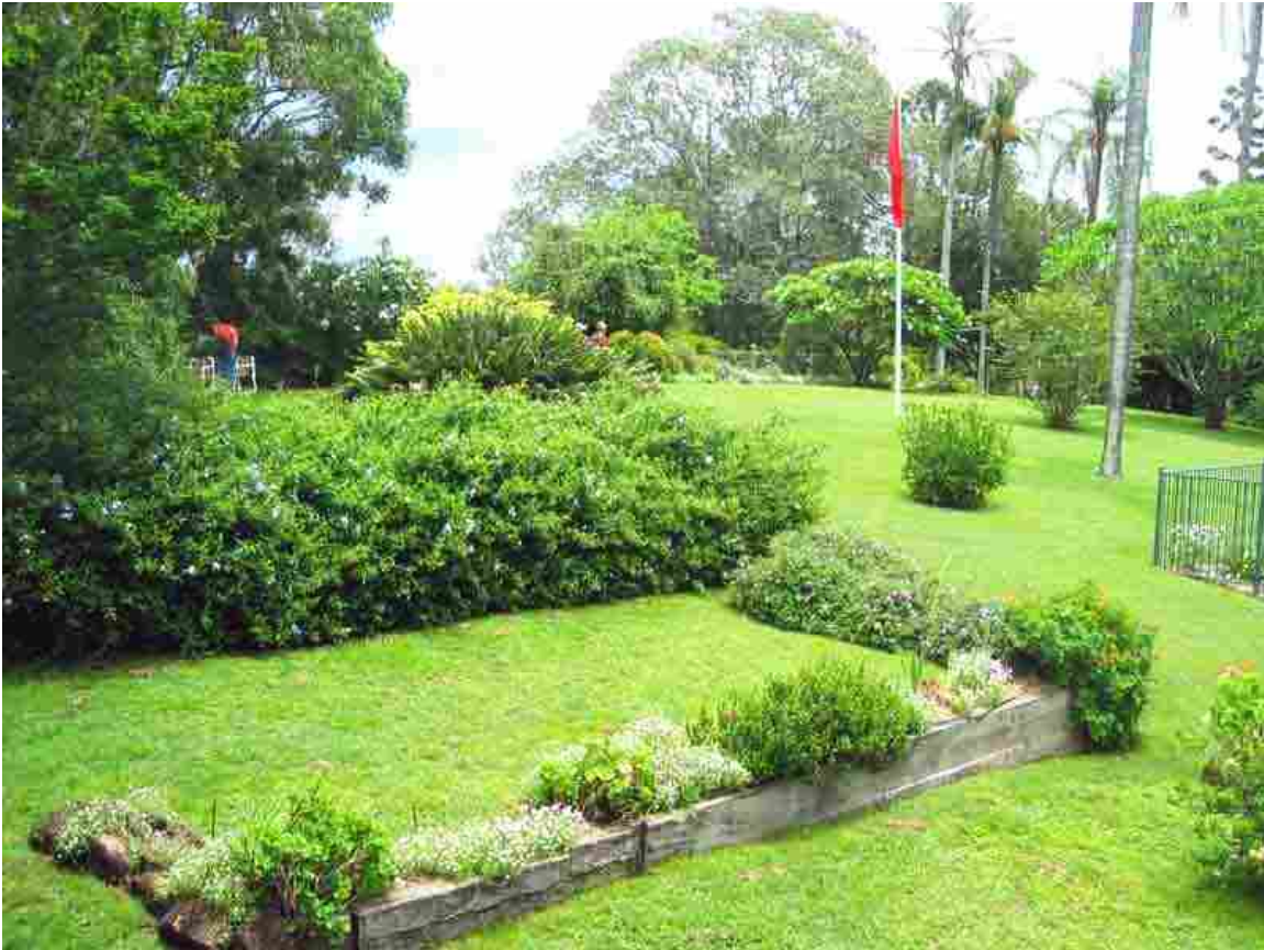
Side view of the north lawn showing the Coochin Coochin flag.

The plants in the gardens are largely old fashioned. Beds of the old variety of 'Crown of thorns' ( Euphorbia milii ) with its old branches covered in lichen flank the entrance. Passing around the verandah through the billiard room which was decorated with a wallpaper scene of fox-hunting in England, we came to the 'Dancing verandah' where we were served a generous morning tea. We noted shrimp plants ( Justicia brandegeana ), coral plant ( Russelia equisetiformis ), agapanthus and unidentified iris. From the verandah we could look past the stand of pale pink frangipani (which grow very well in this situation) and the hedges of plumbago ( Plumbago auriculata ) over to the ranges which served as a barrier for the sheep and cattle in the early days of the property. Soya beans are now part of the cropping of the land, and the plantation of tea-tree ( Melaleuca alternifolia ), that provides oil for export to Germany, has recently been doubled to 14 acres.