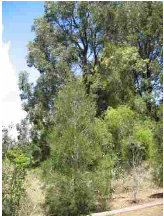
Callitris baileyana in foreground with brigalow ( Acacia harpophylla )- the large silver-leaved tree- behind

In my view the park is important in building knowledge on how to grow the species in the dry scrubs and in creating awareness of the importance of this vegetation type that 150 years of settlement has all but wiped out. Travelling to Rosewood you can see how European settlement and land use has affected the landscape. Native forest and scrub remains on the higher ridges and steep slopes. The flat land was cleared originally to grow sugar