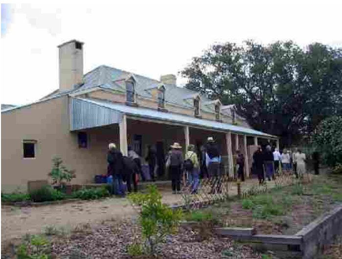
Glenfield from the new kitchen garden