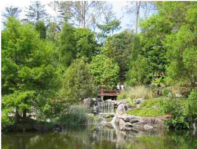
The lake and waterfall at Nerima Garden, Ipswich. The tree on the left is Taxodium , swamp cypress

Finally, the trimmed azaleas. They are in the Nerima Japanese Garden in Queens Park in Ipswich. The oldest part of the garden, at the entrance, was built in 2001. It has a lake and the water and greenery which were a welcome change from the generally dry places we had been in up to then. The garden is well worth a visit, as it has some attractive Japanese design features and very fine bridges, waterfalls and stonework.