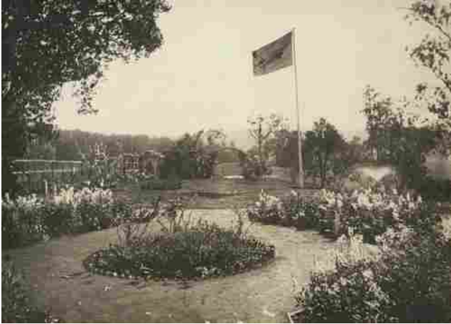
Coochin Coochin garden c.1920 showing formal beds of stocks and the swan flag that shows the Bells were in residence

The Queensland Branch's visit to the historic property, Coochin Coochin, took place on 7 December 2008 on a typically sultry, summer day. We were fortunate in the timing of our visit as the homestead gardens, indeed the whole landscape, was impossibly green and burgeoning. We were advised by our hosts, Tim and Jane Bell, that the property received over 10 inches of rain during November, which a first in the 29 years that Jane has been living there.