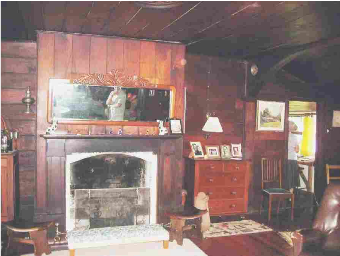
Interior of Coochin Coochin where the Heritage Grant helped stabilise the flooring.

The original homestead was built in 1843, using local red cedar timber. It was moved to its present site on a sandstone ridge overlooking the surrounding grazing paddocks in 1870 and extended several times over the years to a total of 100 squares. The new kitchen was added in 1872, the billiard room (with a wall-paper frieze of a fox-hunt), guest bedrooms in 1910 and the 'dancing verandah' with views to the distant ranges, shortly thereafter. The homestead today has the wonderful rambling character of a Queensland country house, and the receipt of a Heritage Grant last year to re-stump and stabilise the main living room will certainly help to preserve it.