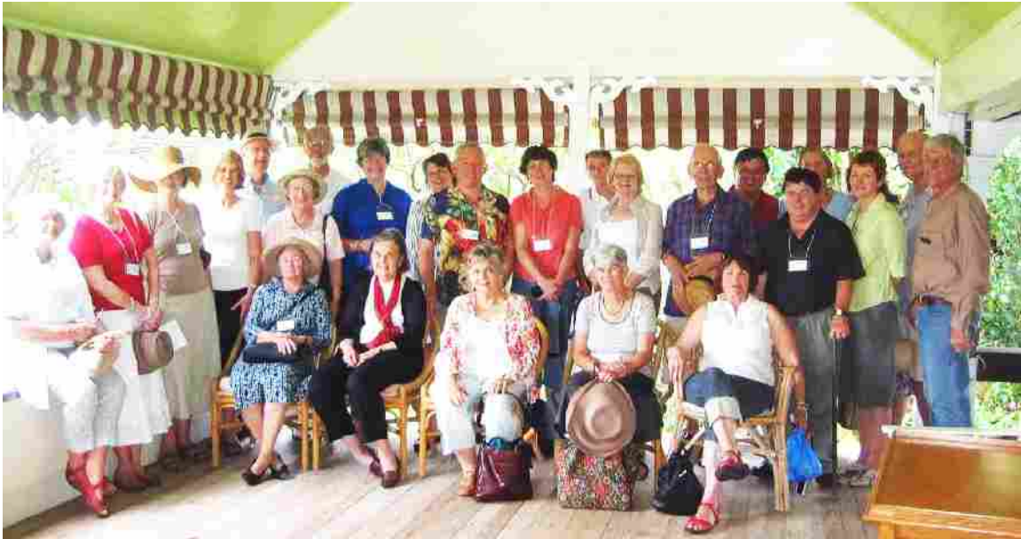
Some of the usual, . . . and not so usual suspects!