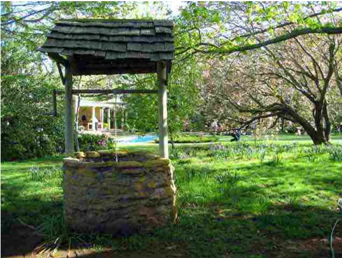
The wishing well with a view to the pool and pool house.

This was our lunch stop, having really only just completed a sumptuous morning tea. We were already convinced that our tour guide was not going to fail our stomach.