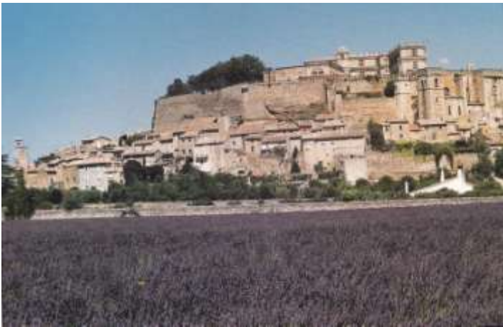
Lavender at Grignan, Chateau de Sevigne, near Avignon.