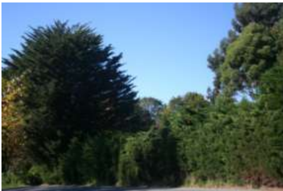
Overgrown and miss-managed hedge, Stirling, Adelaide Hills.

(The Fun part) Planning the Plantings – Of trees, of orchards, of shrub banks, hedges and screens, flower gardens and veggie gardens.