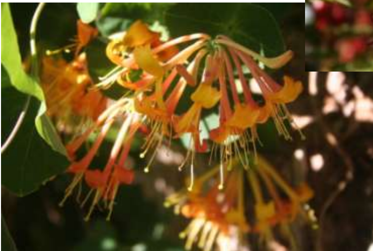
Tough climber with colour