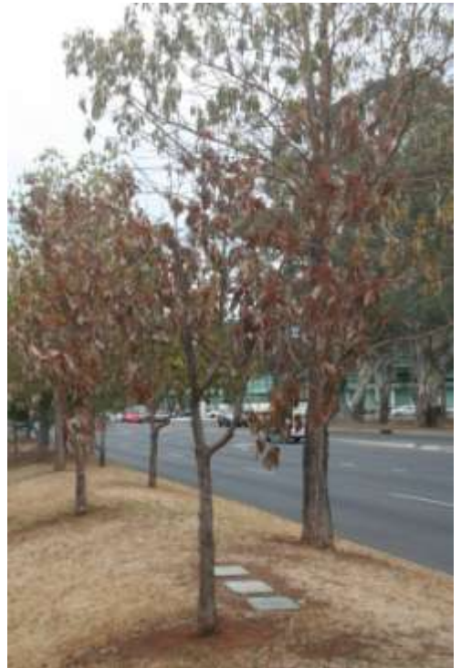
Adelaide streetscape in 2006-2007 drought – no grass and stressed trees