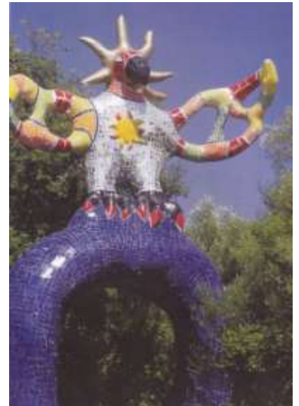
Garden sculpture at Il Giardino dei Tarocchi, Pescia Fiorentina, Italy