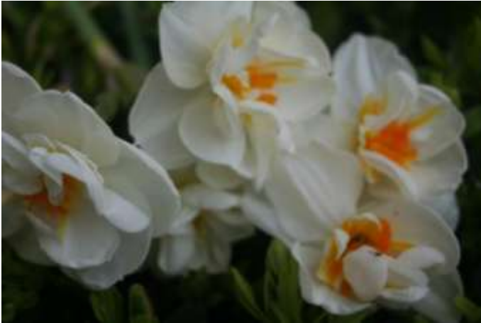
Bulbs for dry climates