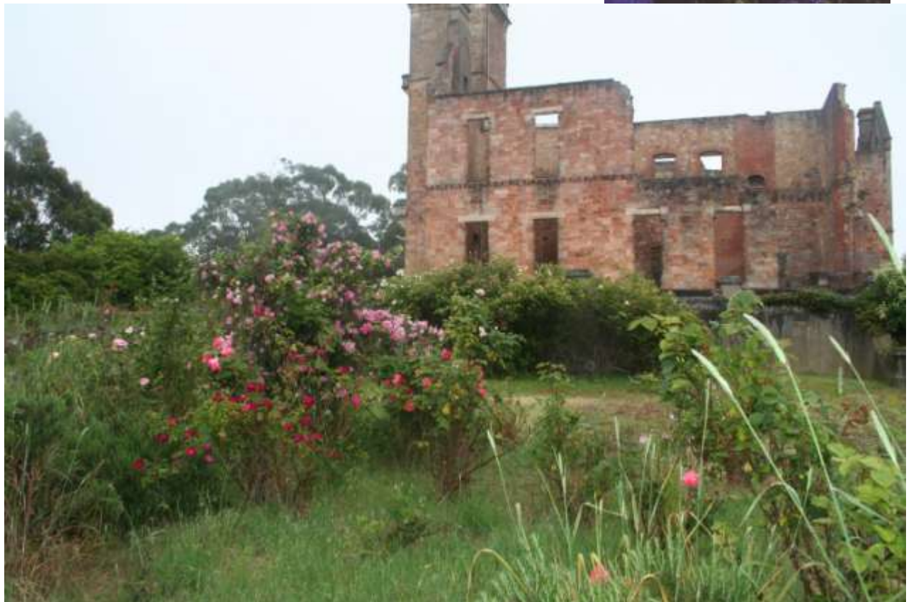
Old fashioned roses, at 'Marble Hills' in the Adelaide Hills, South Australia.