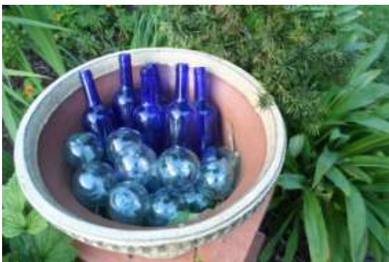
Garden decoration in a dry climate

PLANT for the FUTURE. If it works do more of it. Strive for maximum seasonal impact. Summer will be the new down time. Use objects to furnish a garden.