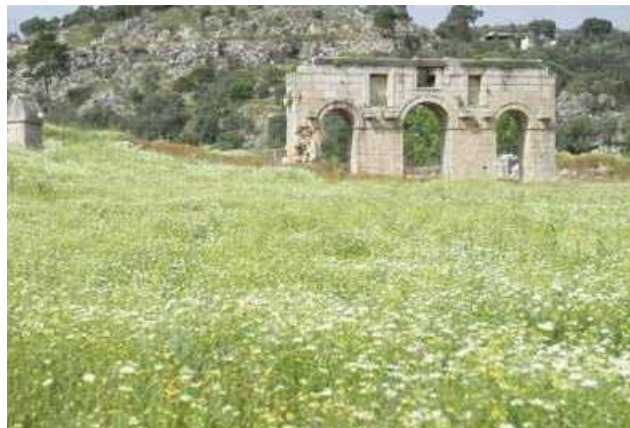
The stunning solitary splendour of an old Roman archway still standing in fields once occupied by the city of Patara

panoramic valley spread out before me with the