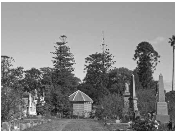
Landscape in the No.1 Anglican. Araucarias on skyline and timber lattice rest house.

Most of the denominational cemeteries also incorporated elaborate ornamental plantations and formal planting along roads and avenues. Extensive remnants of these are still apparent and form a significant cultural landscape setting. Chris Betteridge has noted that Rookwood includes about 400 species of plants and trees, of which about half are native species. In the nineteenth century popular sentiment endowed plant species with symbolic associations. Thus, the plantings chosen for cemetery sites were both meaningful and decorative landscape elements. In addition to the use of traditional species such as cypress, lily, palms and laurel trees, Australian species with similar attributes were also introduced. Dark sombre Araucaria trees, now grown to an enormous height, grace the skyline of the old sections and are