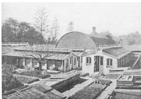
Bush house 1914