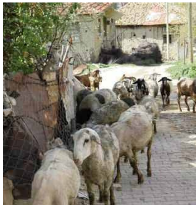
Suddenly spilling out everywhere on the path before me, it was these goats who led me to their shepherd.