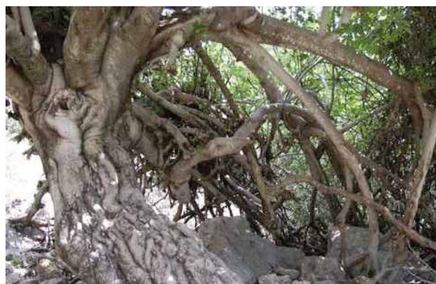
:Ancient gnarled roots of an enormous fig tree, possibly as old as the nearby Lycian rock tombs, growing along a stream running through the middle of Pinara.