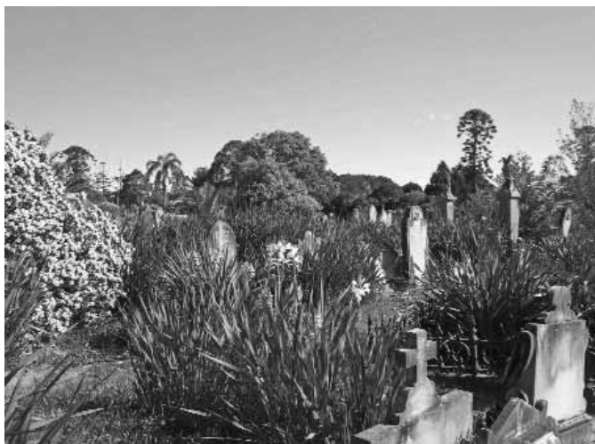
Watsonia and Indian hawthorn, now 'naturalised' across much of the Anglican cemetery.

Sources used include: D.Weston (ed), The Sleeping City: The Story of Rookwood Necropolis , 1988; Historic Houses Trust, In Memoriam: Cemeteries and Tombstone Art in NSW , 1981; Public Works Department, Rookwood Necropolis Plan of Management , 1988.