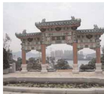
The Dragon Garden