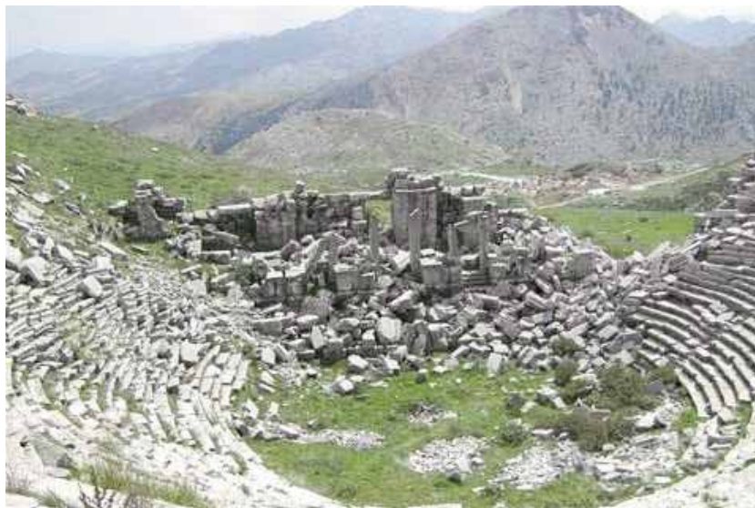
View of Sagalassos showing the low hill behind where Alexander the Great triumphed in battle and won the city.

Paradise is open on Sat. 31st October & Sun. November 1st