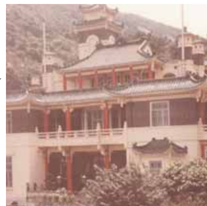
The Tiger Balm Garden.