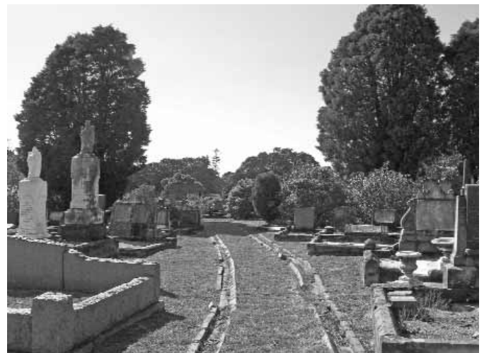
Brick kerbs and gutters formed part of the early landscape detailing. Also note large evergreen conifers.