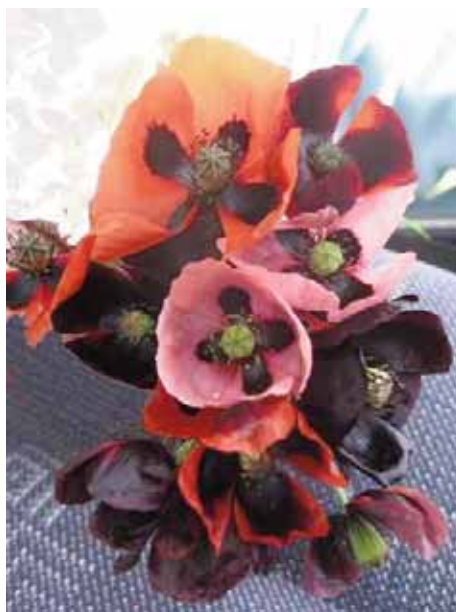
Wild poppies that Bob spotted first in Turkey. Naturally, seed was then collected by everyone in our group!