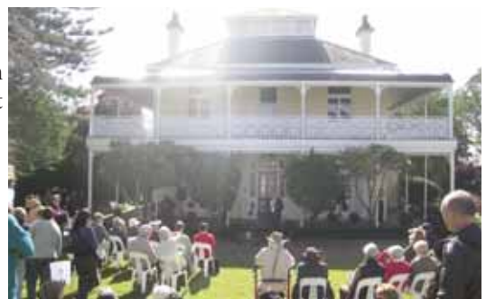
AGHS member, Silas Clifford Smith, speaking at the fundraising day at Claremont

Definition: An easy care garden is one which is safe and pleasurable, requires low maintenance and minimal upkeep. This is achieved by the effective use of mulch and appropriate planting.