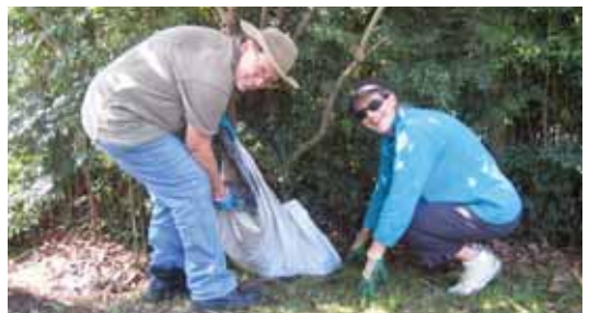
Happy volunteers hard at work