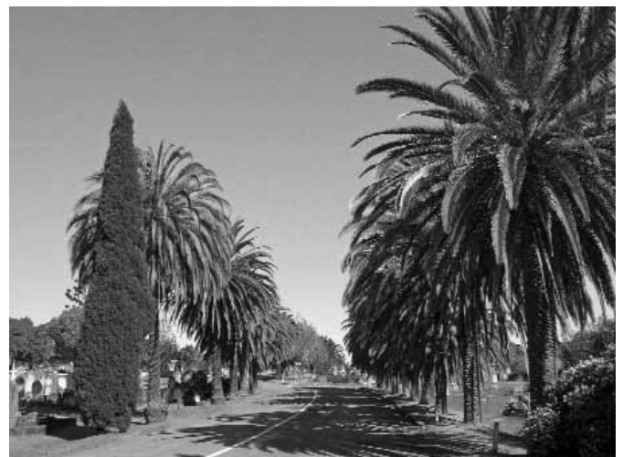
Avenue planting of palms beside Necropolis Drive.