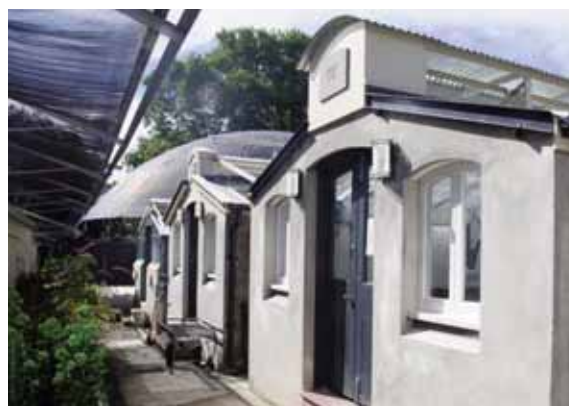
New glass houses