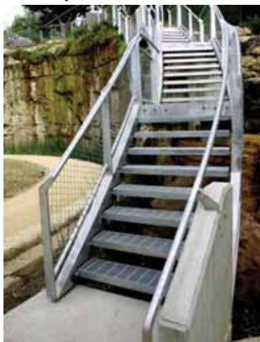
New steps from Waverton Park entry to top terrace level.