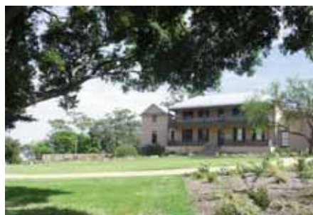
Brush Farm homestead framed by pepper(corn) and lily pilly trees and shrubberies