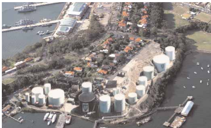
Aerial oblique/photo montage showing the former oil tanks c.1996 Source: BP Australia. PSN Surveying. Photo montage by Arterra Design for North Sydney Council.