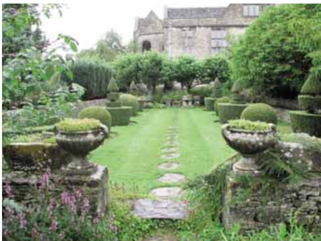
The view from the edge of the garden across the Topiary, Troughery planted with alpine plants to the Winter Garden immediately adjacent to the Rodmarton house and visible from the windows.