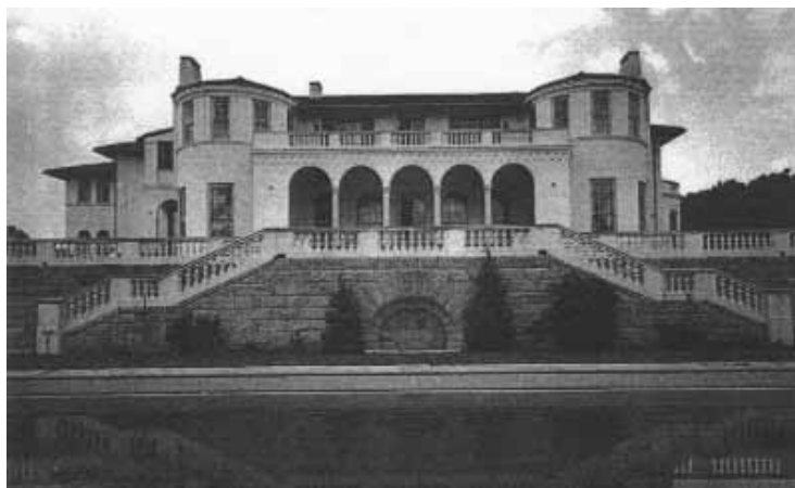
Northern façade, garden and swimming pool