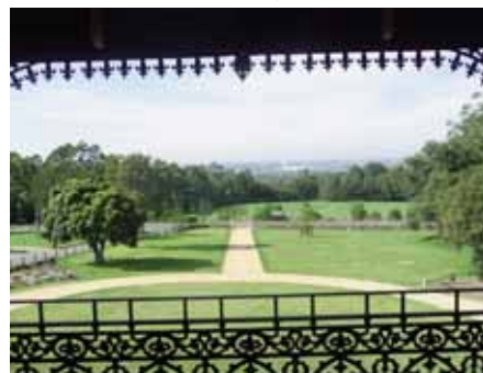
Brush Farm's iron lace-framed view down the drive to the Parramatta River