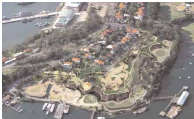
Aerial oblique/photo montage showing 3D digital model of parkland design.