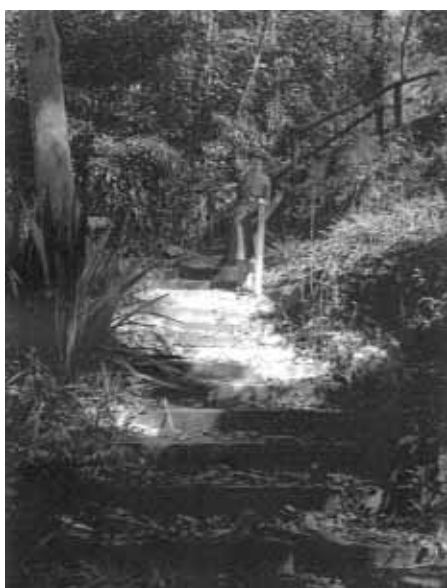
Stairs on the eastern side of the property leading to the wild garden

The full copies of John's reports can be seen at the Caroline Simpson Library at The Mint