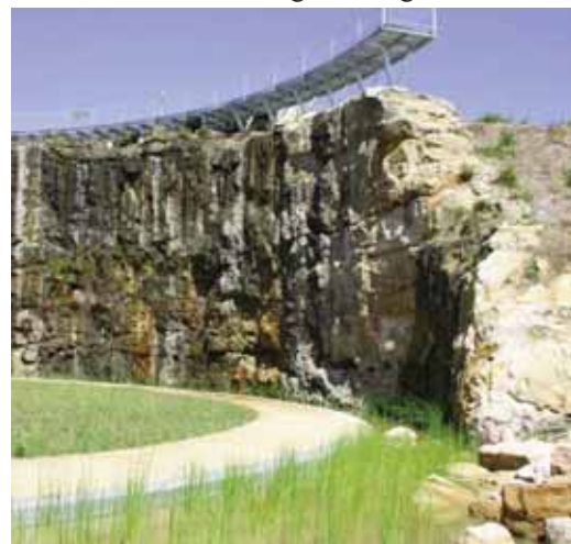
New elevated lookout structure, with grassed performance space & cliff-base frog habitat areas located in former tank footprint, northern end of site