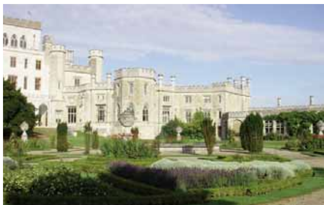
Ashridge House and the Orangery to the right viewed from the Italian Garden, a mid-nineteenth century addition to the grounds.