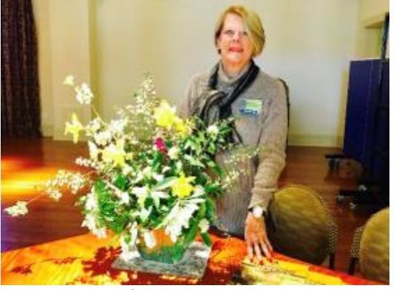
Heartfelt thanks to Jo de Beaujeu