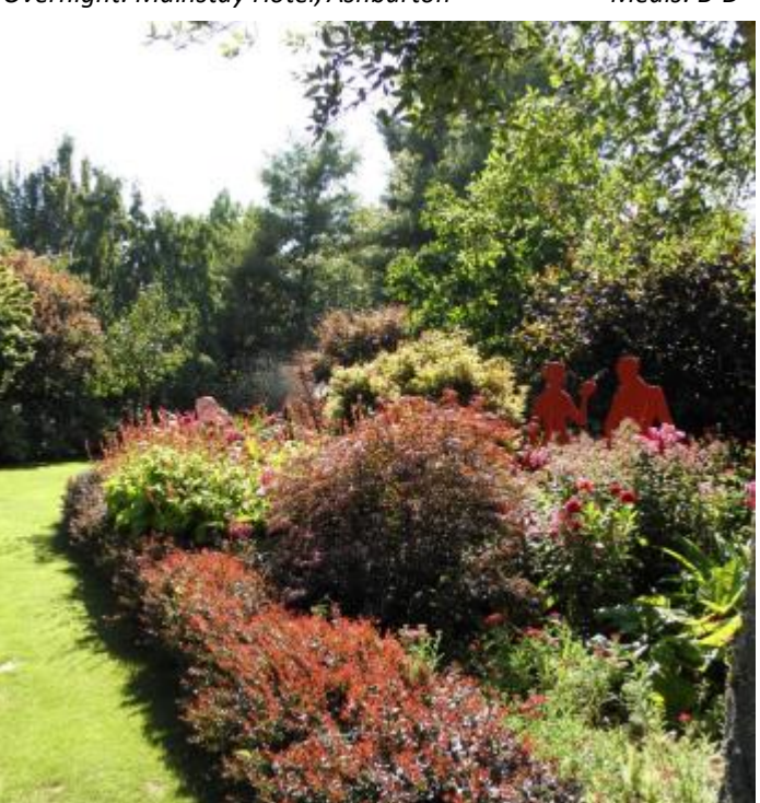
Day 7 Ashburton - Dunedin

Overnight: Mainstay Hotel, Ashburton Meals: B-D