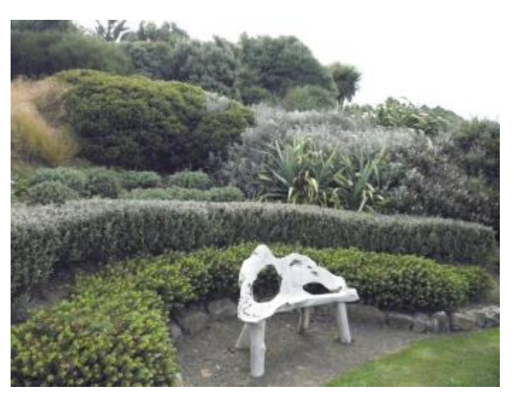
Day 4 Akaroa – Christchurch – Methven

Overnight: Akaroa Village Inn Meals: - L -