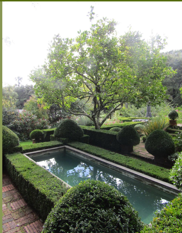
Gillies Garden, Lynne Walker

A day exploring 3 gardens on Wellington's outskirts, all gardens of excellent standard and listed by the New Zealand Gardens Trust. These are an inspiration in layout and planting of varying sizes, all with exuberant knowledgeable owners.