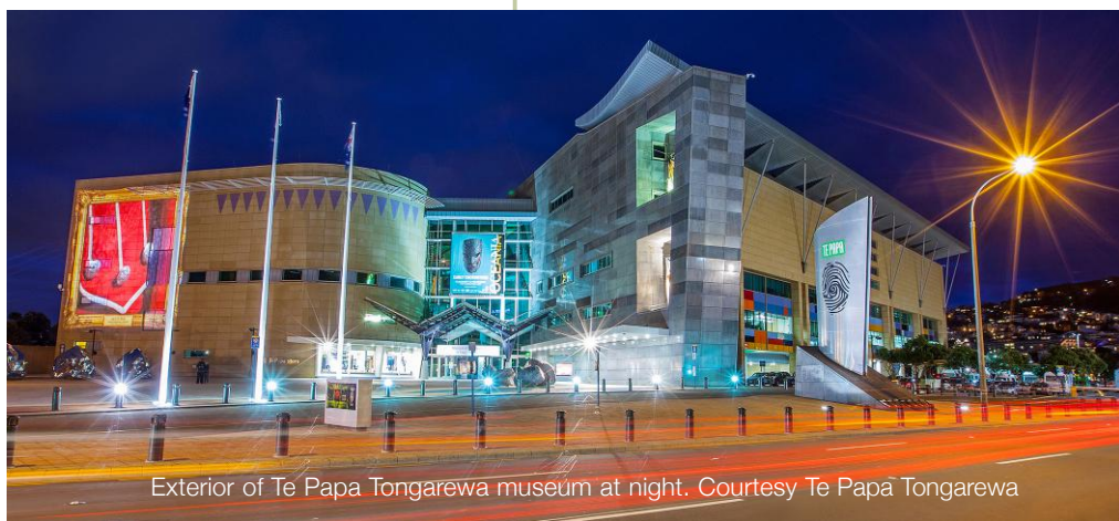
Exterior of Te Papa Tongarewa museum at night.