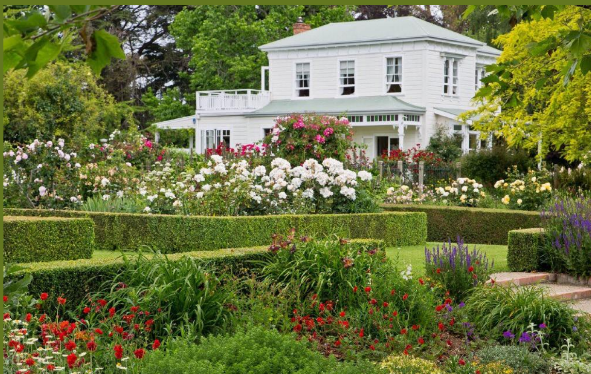
Greenhaugh garden, on the Northern tours, Lynne Aitkins

For full itinerary see www.gardenhistorysociety.org.au