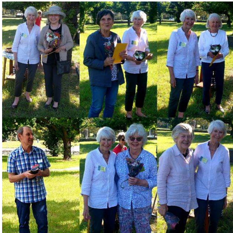
The afternoon concluded with delicious food and drinks and time to catch up with friends, in warm sunshine rather than miserable rain, and a feeling that normality had returned.