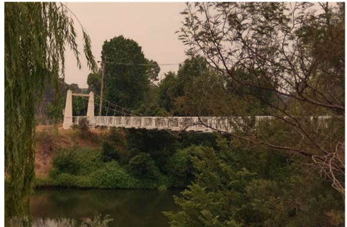
The Suspension Bridge, Queanbeyan.