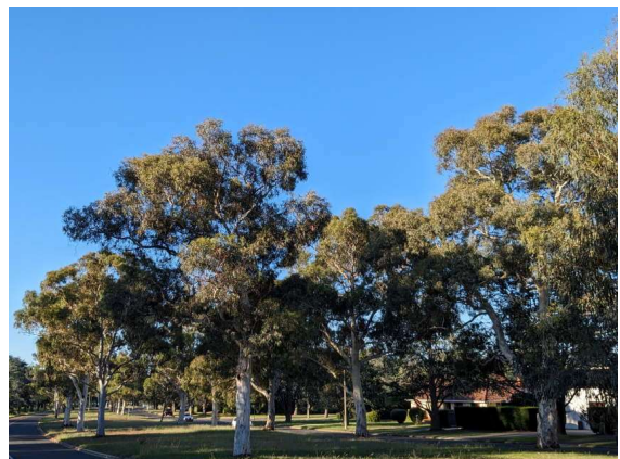
Captain Cook Crescent, Griffith

Our tour leaders will talk about the beginnings of the suburb and how it, and the streets in it, were given their names.