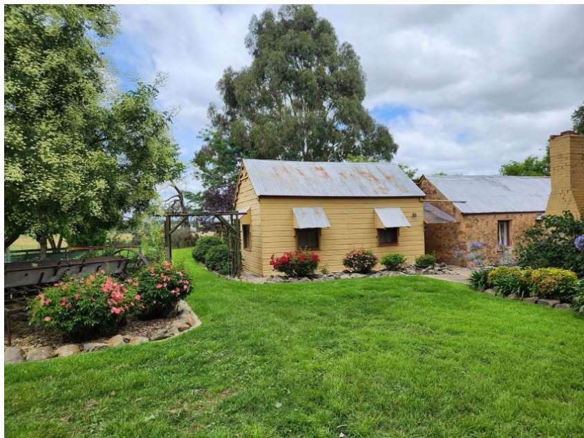
Horse Park

The garden at Horse Park was planted with trees and shrubs that would survive the westerly winds that come across the wetlands, and the garden still has many original trees including elms, cedars and a significant pear tree.