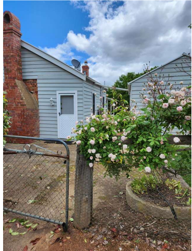
Elm Grove: Photo Jackie Warburton

We will meet at Horse Park, where we will walk round the site, and have light refreshments (no toilet). We will then drive to Elm Grove for a walk/talk. Full details will be sent to you once you have booked.