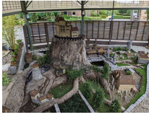
Kentgrove: Medieval village in an old tree trunk & extensive kitchen garden