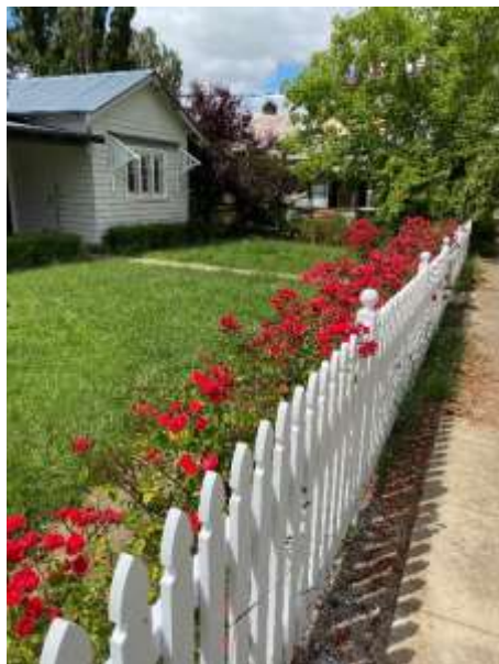
Right: Nimmitabel main street, early January 2022, Far right: Meroogal, Nowra, Sydney Living Museum