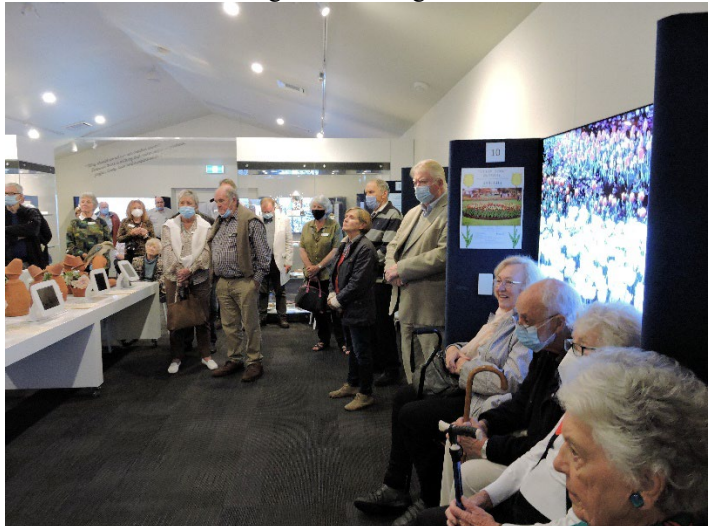
Listening to the opening remarks in the Gallery