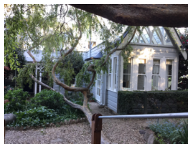
Chinese Elm in the courtyard

an elm to replace a tree which had been felled by the 4" of snow that had just fallen—we think this may be that tree.