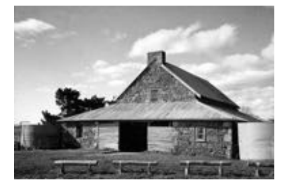
The historic stone woodshed on Arthursleigh built by convicts<sup>1</sup>

The property comprises 19,520 acres and was bequeathed to the university by the late E.T.W. Holt (who developed Sutherland Shire) in July 1979. Arthursleigh is used for teaching and research in pasture agronomy the agricultural sciences. They shear up to 18,00 sheep per year (but due to the drought fewer this year) and November is shearing time. The wool is sold all round the world and considered some of the finest in Australia and in high demand internationally with the design and fashion industry.