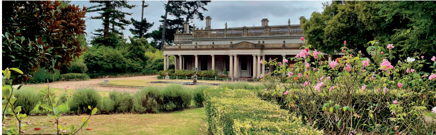
Clockwise from top left: View of Summer House Beleura, Fish pond in Japanese garden, Peter Nicholson in cliff-top garden, Beleura facade.