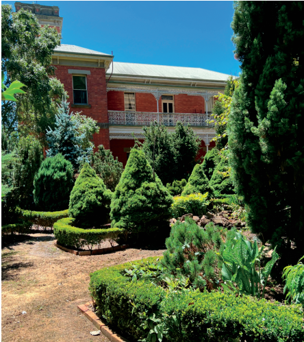
The Holy Plain homestead in Rosedale

AGHS GARDEN TOUR SATURDAY 1 - SUNDAY 2 APRIL 2023