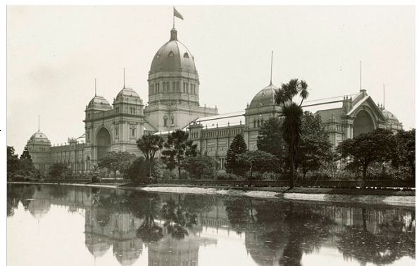
Image: Royal Exhibition Building, 1926

AGHS is currently considering a response.