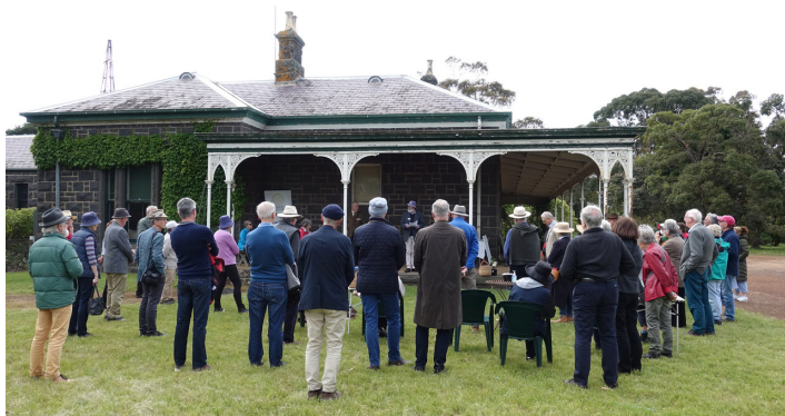
Titanga book launch, November 2021