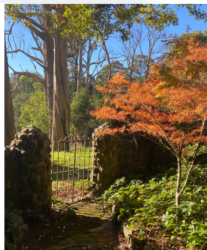
Durrol garden view

REMINDER: THERE ARE A LOT OF STEEP STAIRS AND WALKING ON THIS TRIP SO MEMBERS MUST BE CAPABLE AND PREPARED FOR THIS.