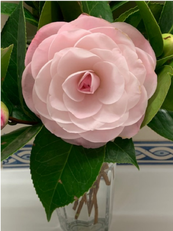
My Photo Camellia Japonica "Desire"

My love of camellias came from my father, who I never knew, as he passed away when I was three. He had a passion for camellias and when my mother remarried and moved from Sydney to Melbourne, she brought quite a lot of his camellias to Melbourne.