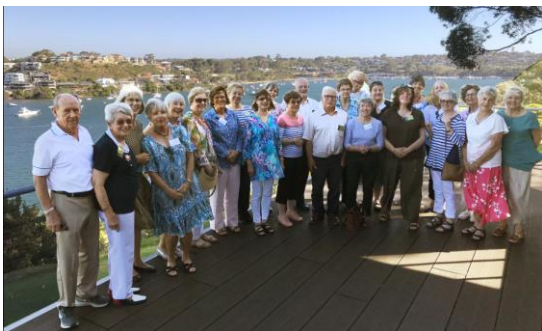
2018 AGHS(WA) Christmas Function attendees.

The branch was inaugurated on the 15th of November 1988 following a public meeting held at Bentley TAFE. Since its inception as well as running regular functions it has hosted three national conferences, mounted two exhibitions on historic gardens of Perth, and held a seminar on trees as well restoring gardens. Invited members contributed to The Oxford Companion to Australian Gardens and A Guide to Conserving and Interpreting Gardens in Western Australia published. An index to the West Australian Gardener magazine was produced, three grants for garden restoration projects have been allocated as well as advice and information on gardens of heritage listed properties provided. Members of the original committee were invited plus previous chairpersons who together cut the cake to celebrate 30 years of the branch's operation.