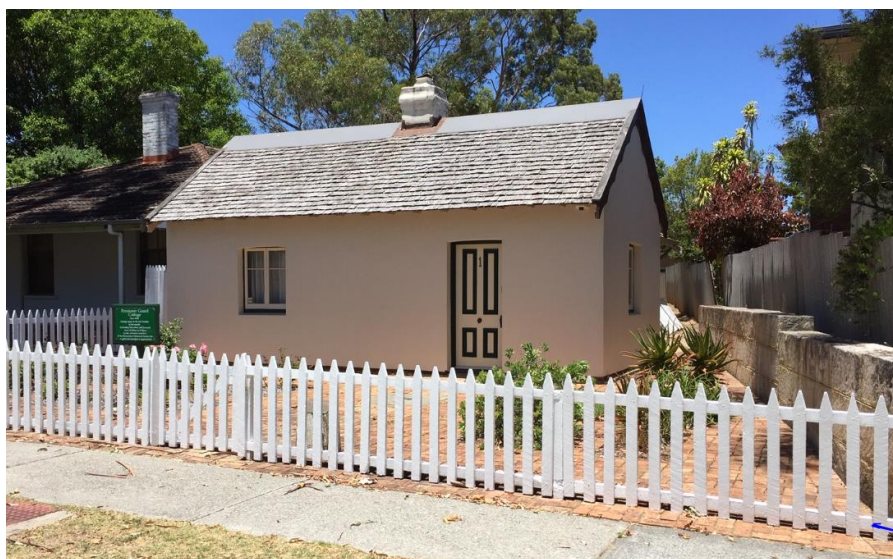
Pensioner Guard Cottage, Bassendean.

https://www.bassendean.wa.gov.au/community/places-to-visit/pensioner-guard-cottage.aspx