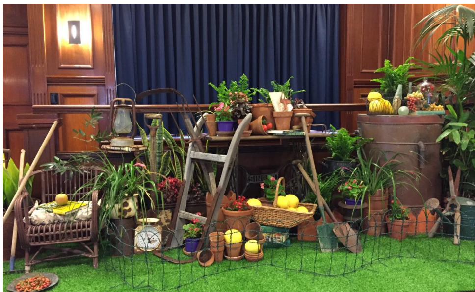
Display of gardening implements from the Historic Gardens of the Western Suburbs by Kazz Morgan.

The West Coast Gardening Club requested the presentation on the branch's recent exhibition Historic Gardens of Perth Western Suburbs. The Grove Community Library recently displayed part of the exhibition at the Grove Community Library to coincide with it. The Hollywood Kings Park Probus Club has requested the presentation for their April meeting.