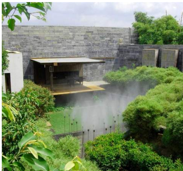
HALF WAY RETREAT, Ahmedabad Courtesy, Aniket Bhagwat

There is much to see in Ahmedabad such as the works of Corbusier who was sponsored by Nehru to work in Chandigarh and Ahmedabad. The Times of India voted Ahmedabad ‘ the best city to live in India ’ and in 2010, it was ‘ ranked third in Forbes’s list of fastest growing cities of the decade ’. As Aniket observes, it is a city of much design creativity.