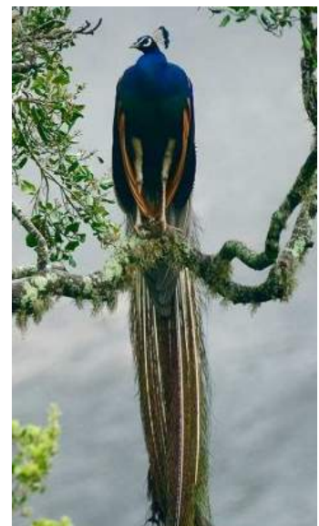
Peacock, Yala N.P.

We drive to Colombo and either depart on an evening flight or stay overnight near the airport at the coastal town of Negombo.