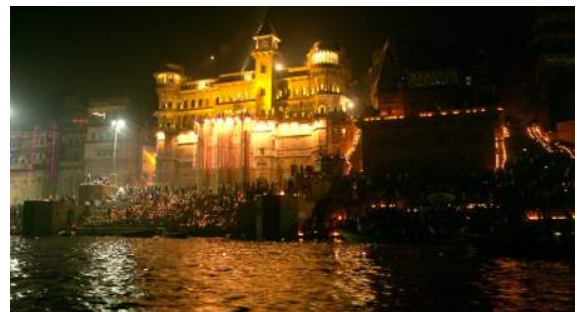
The Newly restored Brijrama Palace Hotel

The Brijrama Palace Hotel is a newly restored old landmark of Varanasi which dates back to 1812. It is brilliantly located on the ghats of the Ganges and has just recently been re-opened to the public.