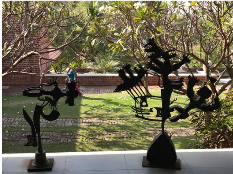
Sculptures in a Gallery, Baroda Artists Colony

This morning we take a day trip into the hinterland to a major artists colony at Baroda . It contains a remarkable collection of paintings, sculptures and a range of artefacts within spacious grounds. Its benefactor will normally host our visit to this complex which annually enables many gifted artists from around the world to take up residency for creative studies, exhibitions, etc.