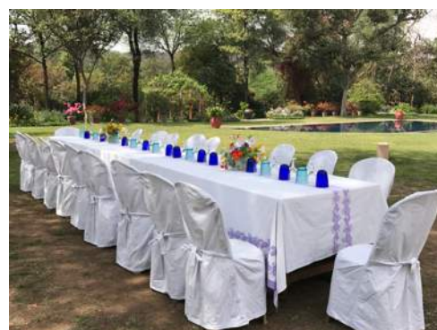
Ready for lunch at Tikli Bottom