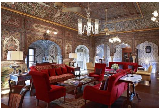
Samode Haveli, Jaipur

Samode Haveli, Jaipur – www.samode.com 4.5 Stars – This fabulous palace is quite unique in the Old City now operating as a hotel. It is our favourite hotel in India with good facilities including a large, beautiful pool and spa. It is, ..an oasis within the walled city of Jaipur and is a traditional Indian mansion set in a garden and intimate courtyards. Built 175 years ago, for the rulers of Samode, it is still occupied by their descendants, who have converted their home into a luxury hotel.