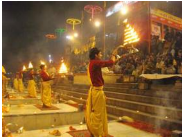
Ganga Aarti, Benares

It is essential to have your own travel insurance to protect your position and it is a condition of travel that you take out comprehensive cover for Medical (including repatriation), lost luggage, tour cancellations and any other potential losses. This helps ensure that any problems can be rapidly resolved.