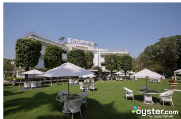
Will you join us for a G and T in the gardens at the Claridges?