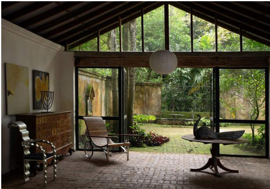
Looking to the garden, Lunuganga Country Estate.

For information, visit http://www.geoffreybawa.com/lunuganga-country-estate/introductionpage