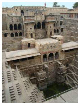
Baori Haveli Stepwell