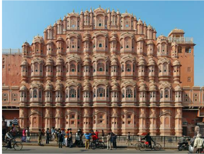
The Hawa Mahal, Jaipur

Mon-Tue, 18 & 19 February, Jaipur-Fatehpur Sikri-Agra. Taj Gateways, with Taj views from our window.