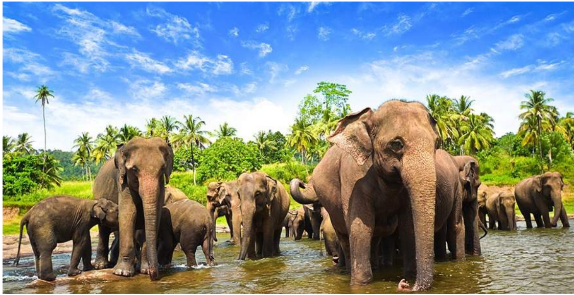
Minneriya National Park

Sri Lanka has 2,500 years of continuous written history and was first occupied by the Portuguese in the 16th century, the Dutch in the 17th century, became a British colony in 1815 and gained independence in 1948. With its rich history, we visit ancient cities, sculptures, temples, jungles, an elephant and other wildlife reserves, a tea plantation and much more.