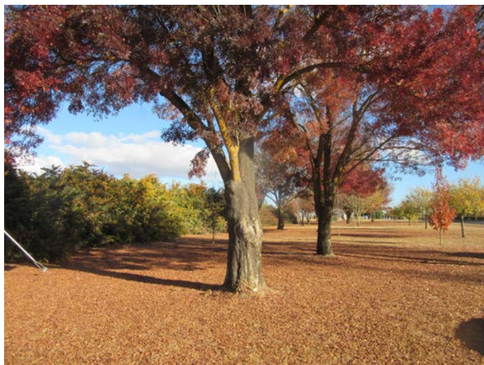
Trees in Memorial Park showing their autumn colour. The ground is covered with a carpet of fallen leaves.

The Guyra Argus , 6 September 1951 published a detailed report on the celebrations held on Saturday 1 September. Trees were planted at the various venues and moved to Memorial Park near the Shire Council Chambers where the Guyra Brass Band played. Memorial Park was dedicated to the memory of those who gave their lives in the service of their country. Trees were planted by representatives of the R.S.L., Chamber of Commerce, Rotary Club, Guyra Hospital, Horticultural Society and C.W.A. A tree was planted at the Bowling Club as well as trees and shrubs at the C.W.A. grounds