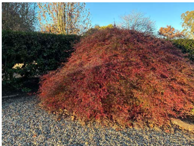
Acer palmatum dissectum 'Emerald Lace' An American hybrid form of the well known Japanese Maple. It prefers moist well-drained soil.