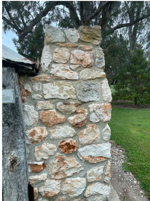
External chimney built of stone