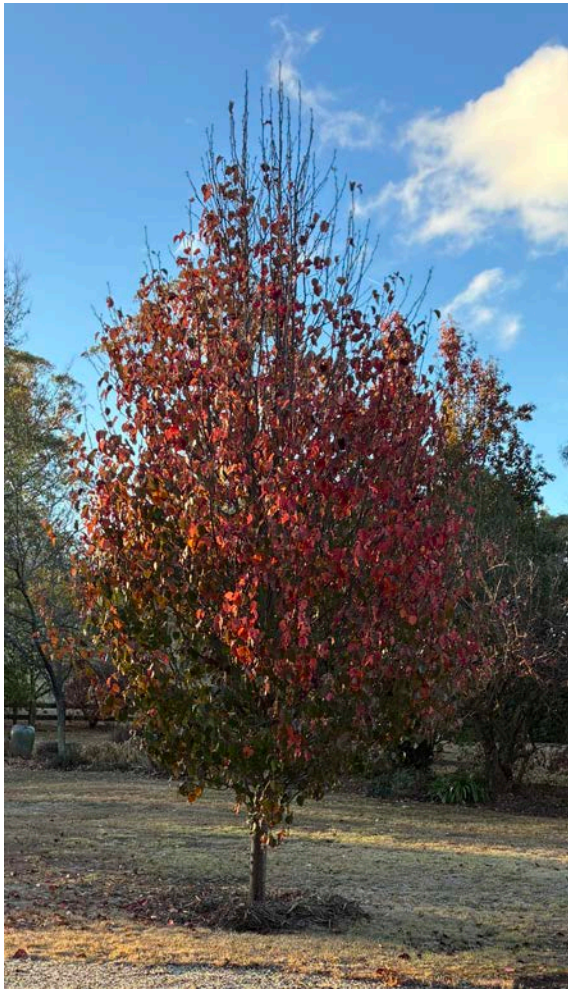
Bradford Pear Pyrus calleryana 'Bradford' An ornamental pear growing to 12m. Originated in China