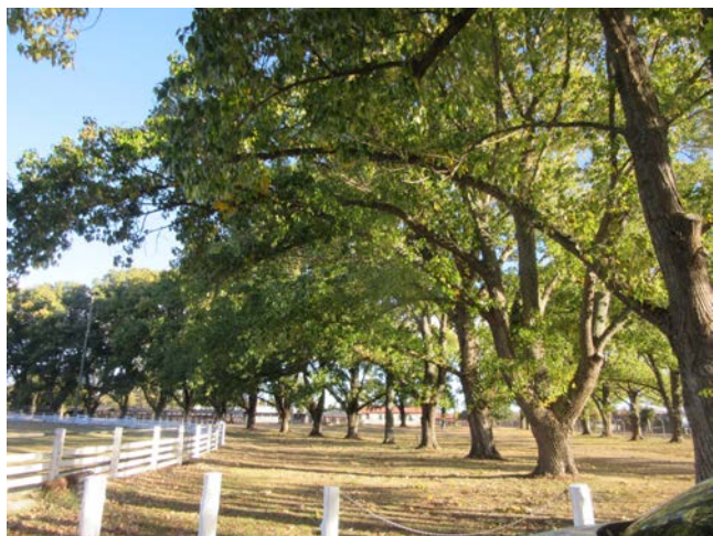
Chinese Poplars ring the field.