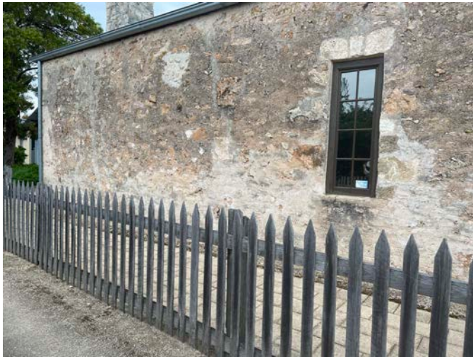
Side wall of the old church.