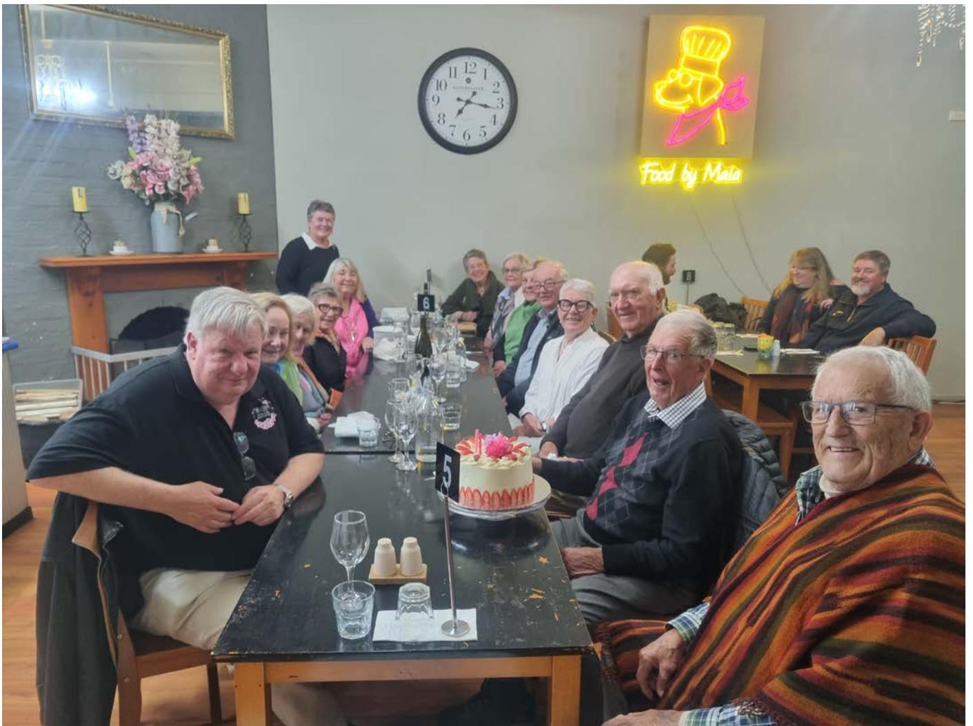
The group had an excellent meal at Blind Chef.