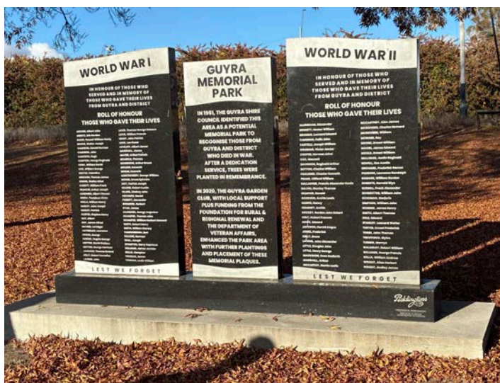
The war memorial