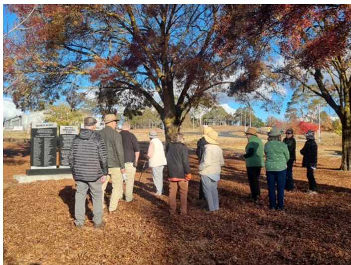
The group near the war memorial