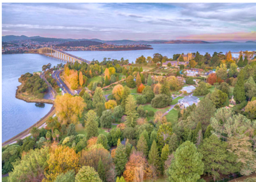
Royal Tasmanian Botanical Gardens and Government House

Full conference delegates attending garden visits must travel on conference coaches and be fit and capable of walking at least 3km to 4km unassisted. Please note that some gardens may involve uneven ground, sloping terrain, stairs and steps. If you require assistance, please make arrangements for a personal carer to be included in your booking and notify AGHS by email. Alternatively consider attending the conference as a lectures-only delegate.