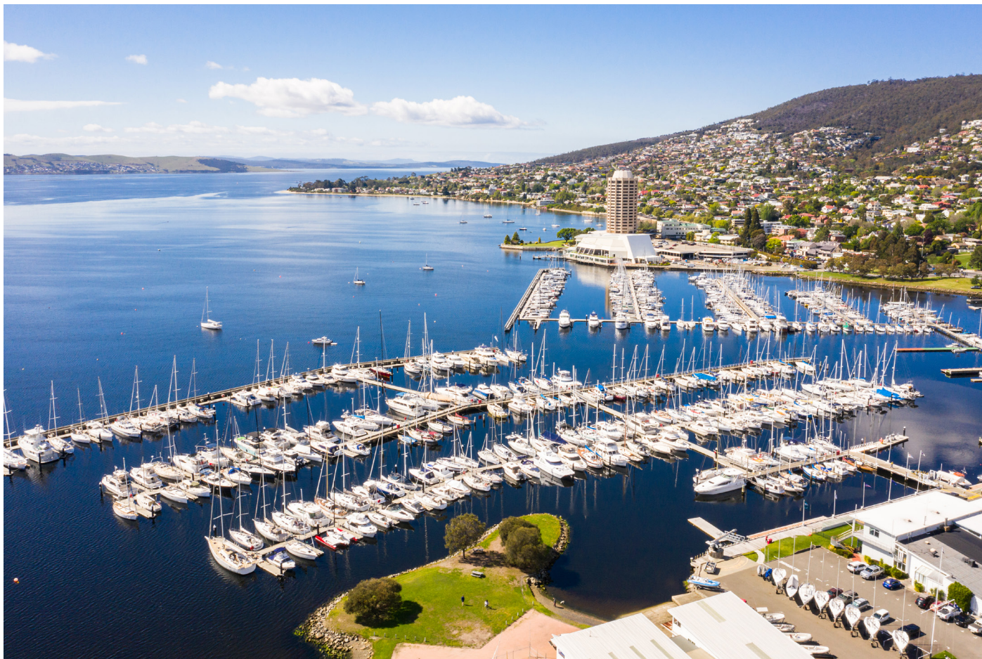
Wrest Point Hotel and the Royal Yacht Club of Tasmania on the banks of the River Derwent, Sandy Bay

The conference is being held at Wrest Point Hotel, Sandy Bay. The program is broken into morning lectures followed by garden visits in the afternoon.