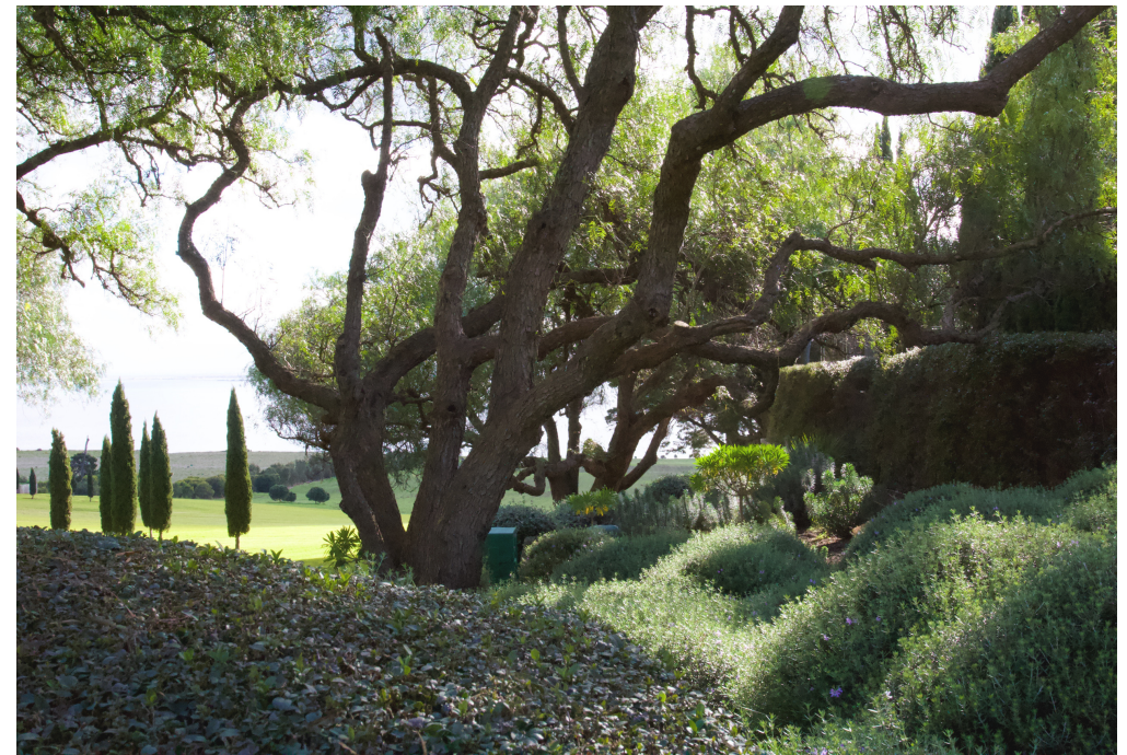
Spray Farm garden view.