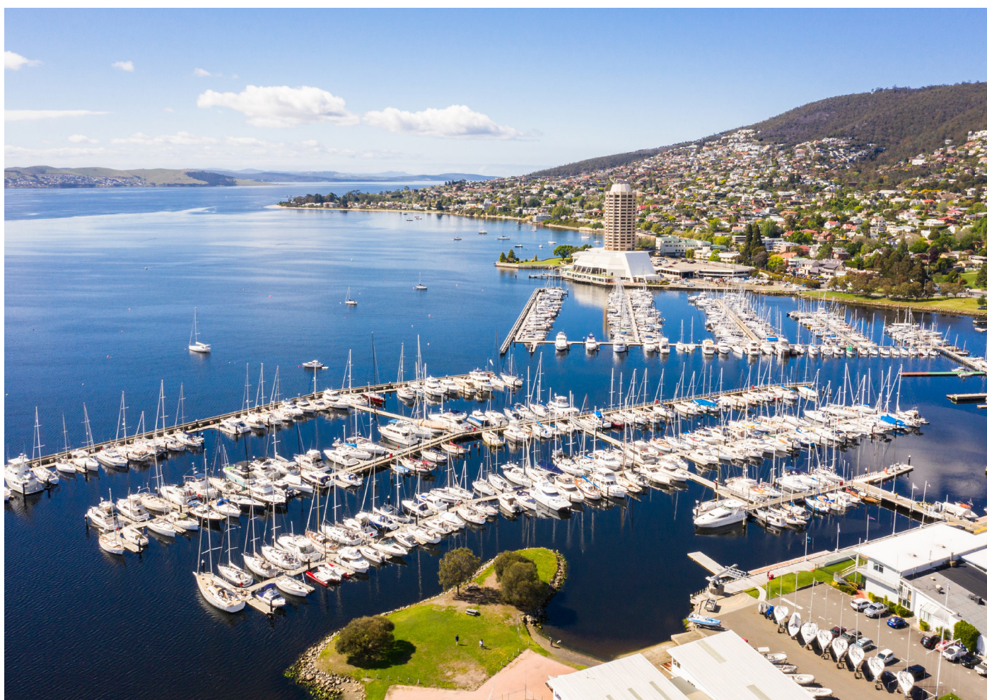
Wrest Point Hotel and the Royal Yacht Club of Tasmania on the banks of the River Derwent, Sandy Bay