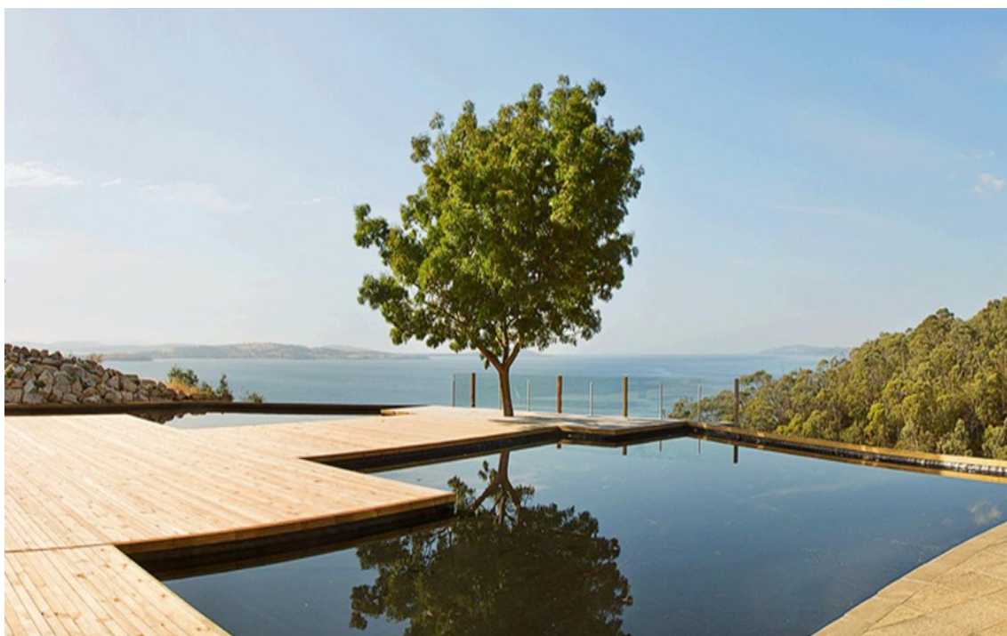
Glen Albyn - the conference dinner venue

Cheque enclosed (Payable to Australian Garden History Society).