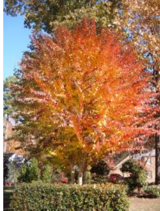
crepe myrtle autumn - Bing images