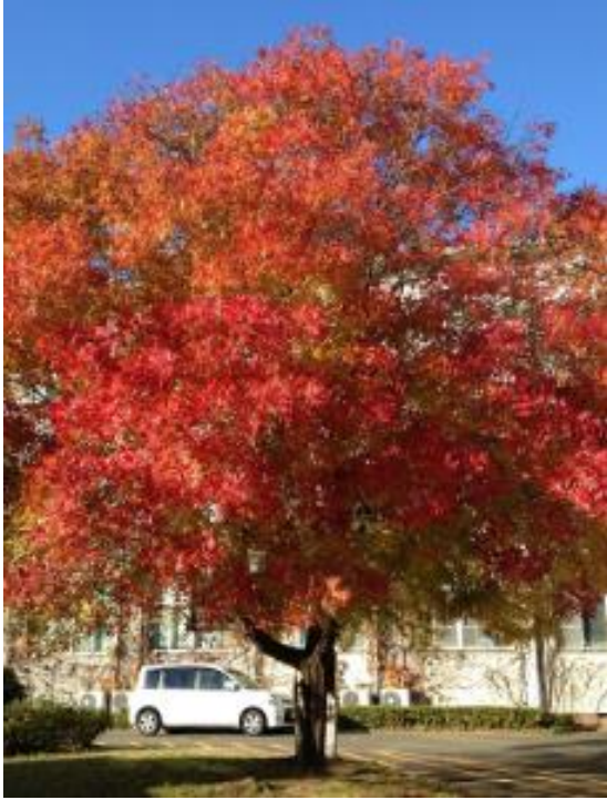
Chinese pistachios - Bing images

Prior to the welcoming rains, the dry autumn has produced some spectacular colours in liquidambar, Chinese tallows, crepe myrtles, claret ashes and Chinese pistachios around Perth.