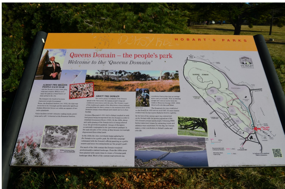
Above) ironic that this great sign is in Hobart's Queen's Domain – but also, soon could be a whopping stadium and no doubt, huge lighting towers for night AFL events – a major visual and noise intrusion. And high density housing also right alongside....

It appears the state government will declare the project 'state significant', side-stepping open public consultation, with decision-making behind closed doors. To date there are no plan or plans in the public domain. The federal government has changed the scope of Infrastructure Australia's work – excluding assessing 'social infrastructure' like this – so the project will not go through that body, to check its viability, business case, etc. A state government analysis released in January found the Macquarie Point Stadium would generate a loss of $300m over 20 years' operation. Astounding waste of public money. This in comparison to the National Heritage Listing of Sydney's Domain and Macquarie Street Government precinct and care taken over it. Or to Adelaide Parklands' National Heritage Listing (although that is coming under threat, too – see South Australia ). A public rally opposing the stadium is on 13 May 2023 in front of Parliament House, Hobart. In July 2023 there were calls to save an historic Rail Goods Shed which is in the way of the proposed stadium structure. This c1915 shed could be given state heritage listing this year. That (and whether it stays, or is moved) are matters for the Tasmanian Planning Commission. The opposition have asked if it might be demolished suddenly before an assessment can occur. A 2015 report for Macquarie Point Development Corp. found the shed met 7 of 8 state heritage assessment criteria. AGHS is keeping a close watch on this one.