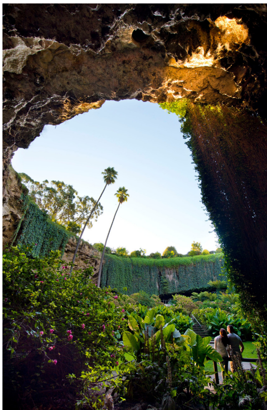
Umpherston Sinkhole/Balumbul, photo Adam Bruzzone, courtesy South Australian Tourism Commission