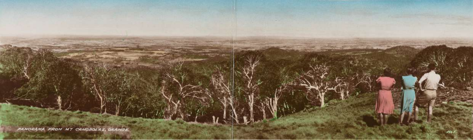
PANORAMA FROM MT CANOBOLAS, ORANGE